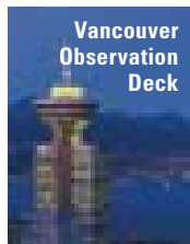
Vancouver Observation Deck

Your rail vacation package may include admission to the Vancouver Observation Deck, the Calgary Tower or the Whistler Mountain Gondola (or to an alternate attraction if not operating). These admissions can be used at your leisure.