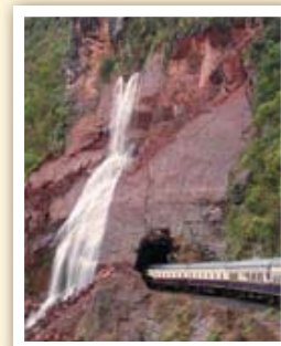
The GrandLuxe Express in the Copper Canyon

One of the most scenic rail routes in the world. Morning at the rim of the canyon • Dance demonstration by Tarahumara Indians • Geological discussion • Descend through the Copper Canyon on the railroad that took over 90 years to build • Cross over 37 trestles and through 86 tunnels—including one that makes a 180-degree turn inside a mountain • Entertaining lectures • Overnight GrandLuxe Express (B,L,D)