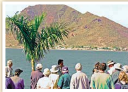
Jacques Cousteau once described the Sea of Cortez as the "aquarium of the world" and the "Galapagos of North America" due to its abundant sea life.

Choose from: Cruise on Topolobampo bay • Sugar plantation • Botanical gardens and orchards • River float trip, great for birdwatching • Overnight GrandLuxe Express (B,L,D)