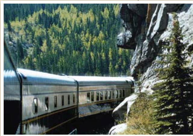
◀ The GrandLuxe Express brings you up close to nature that can only be seen by rail.

DAY 3 YELLOWSTONE NATIONAL PARK The world's first national park teems with wildlife and natural wonders. Old Faithful • Fountain Paint Pots • West Thumb Geyser Basin • Board the GrandLuxe Express • Overnight GrandLuxe Express (B,L,D)