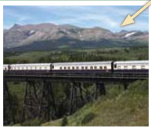
Glacier National Park