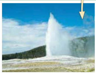
Yellowstone's Old Faithful