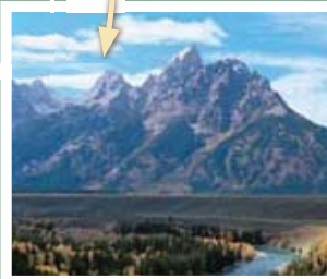
Grand Teton National Park