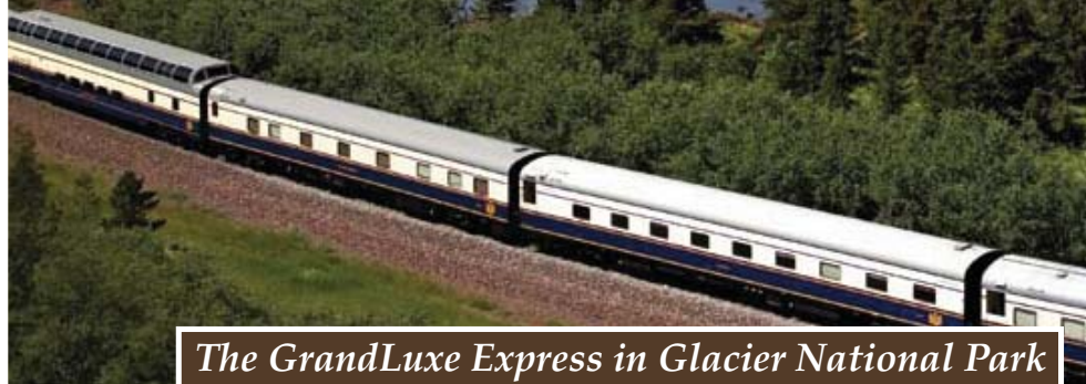
The GrandLuxe Express in Glacier National Park

EXPERIENCE FOUR NATIONAL PARKS AND THE ROCKIES ON THIS SCENIC LUXURY RAIL ADVENTURE