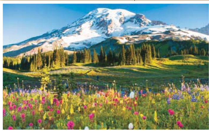
◀ 14,410-foot Mt. Rainier, as seen from Paradise, which we visit on Day 8.

The world's first national park teems with wildlife and natural wonders. Old Faithful • Upper and Lower Yellowstone Falls • Fountain Paint Pots • West Thumb Geyser Basin • Board the GrandLuxe Express • Overnight GrandLuxe Express (B,L,D)