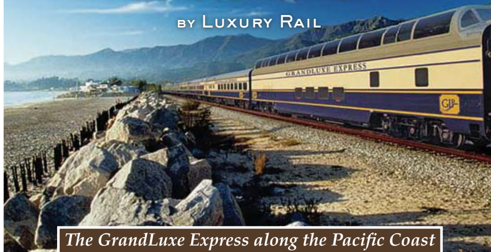
The GrandLuxe Express along the Pacific Coast

SANTA FE, GRAND CANYON, SANTA BARBARA, SAN FRANCISCO, NAPA, AND THE SEATTLE AREA BY LUXURY RAIL