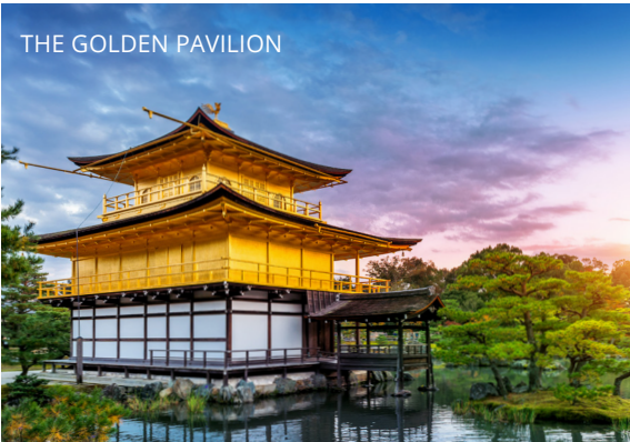
THE GOLDEN PAVILION

Favorite destinations, fresh opportunities for adventure