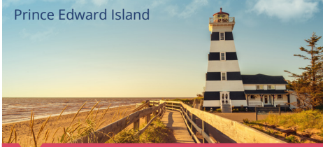
Prince Edward Island

To book and for information go to vacationsbyrail.com or call 877-253-9891 & speak to a rail specialist