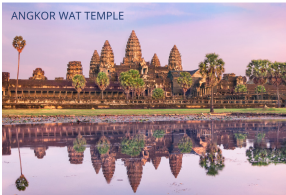
ANGKOR WAT TEMPLE