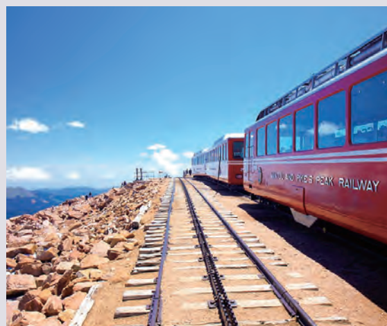
Pike’s Peak Cog Railway