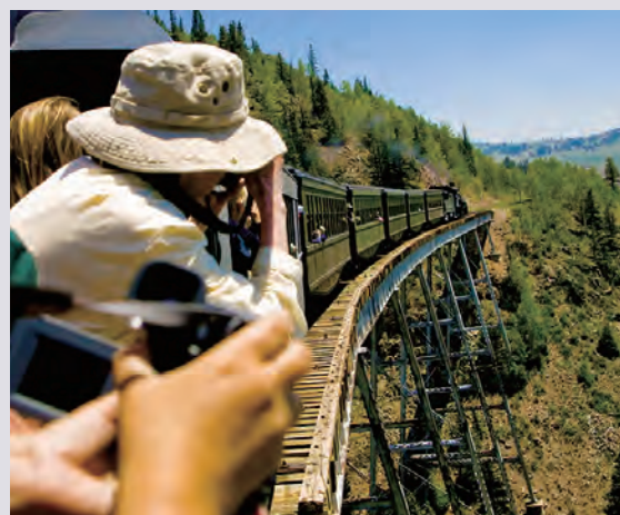
Cumbres & Toltec Scenic Railroad