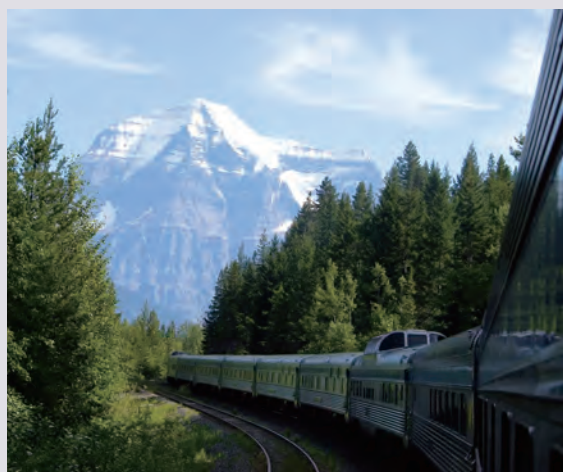
VIA Rail's Canadian