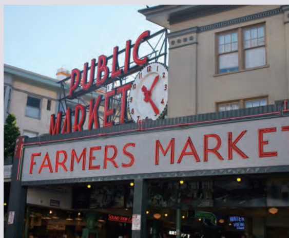
Seattle Public Market